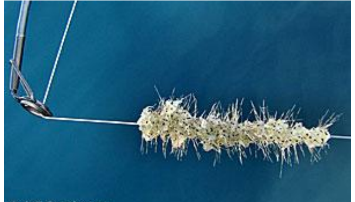
Sticky Spiny Water Fleas on fishing line

Learn more (including photos) at StopSpiny.org